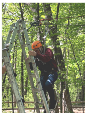
Successful Zip Line