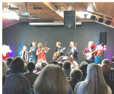
Benson Family Singers